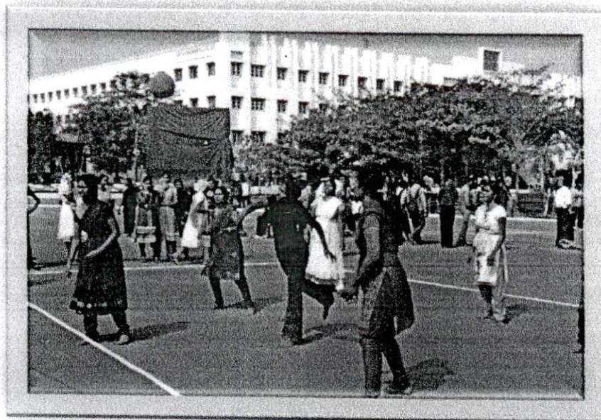
During the match of Throwball Tournament-2017